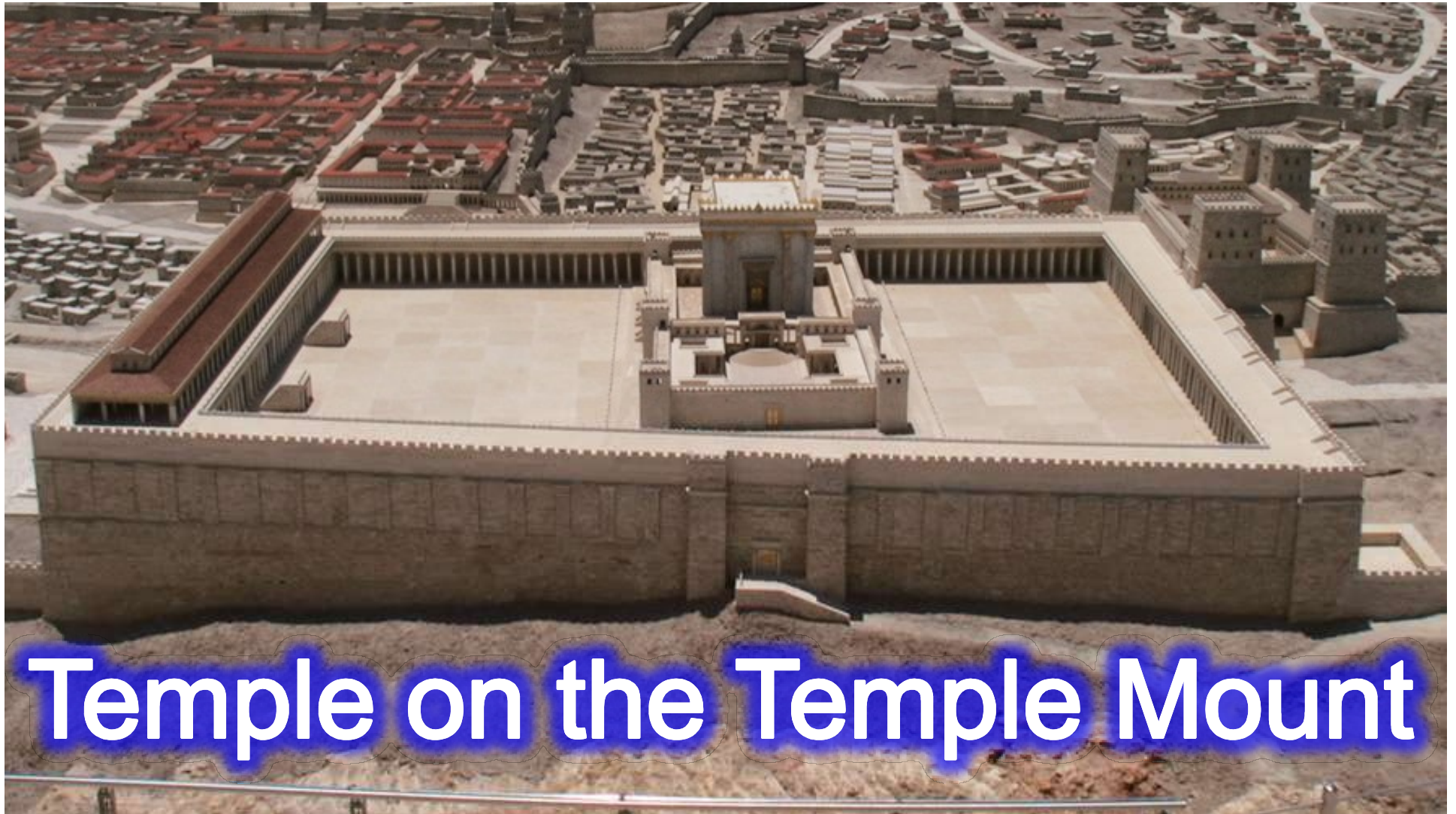
Temple on the Temple Mount